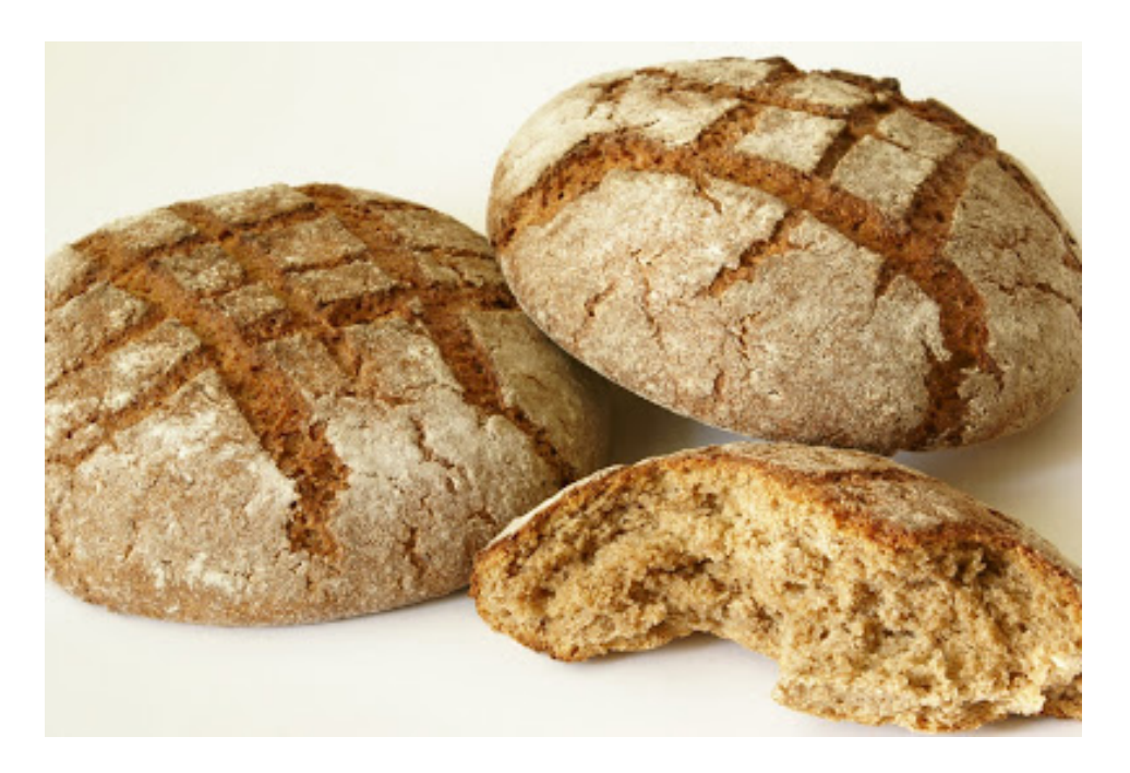
Faith is the Daily Bread that God Gives Us

a sermon for young adults on the occasion of their public profession of faith at a confirmation service in Germany in 1938