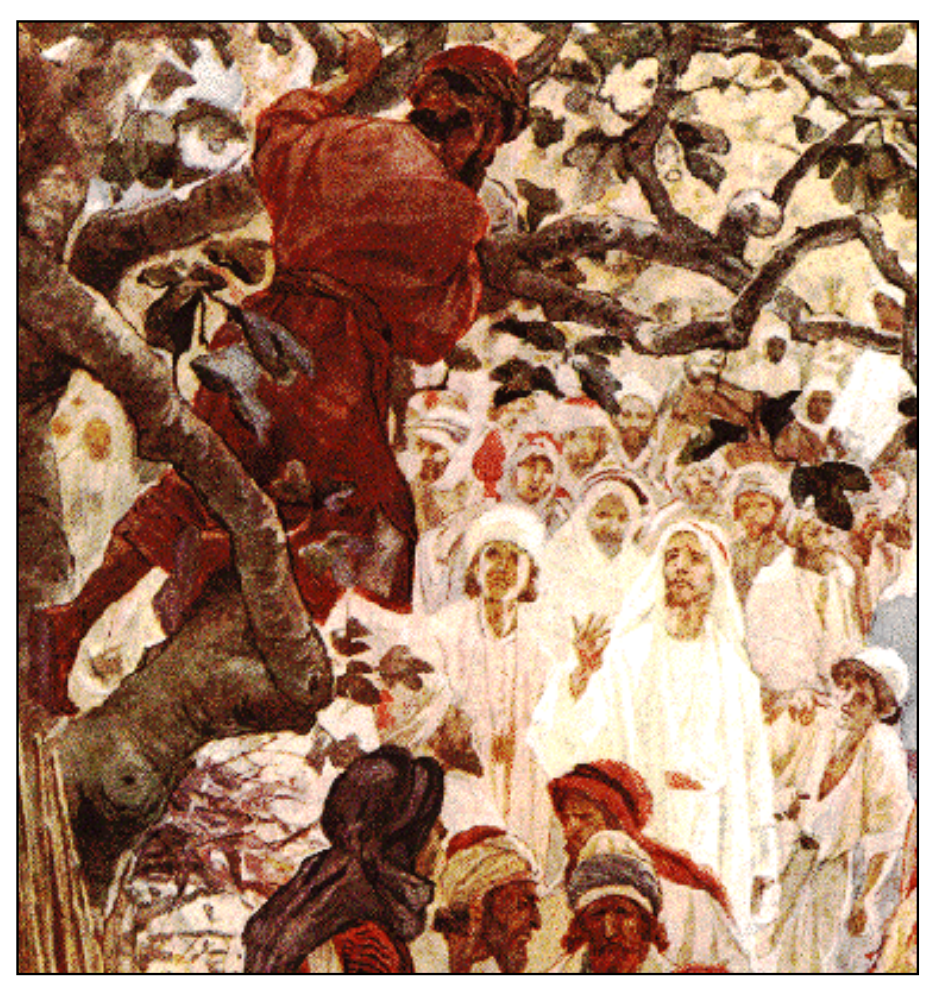
Zacchaeus being called down from the tree - by William Hole