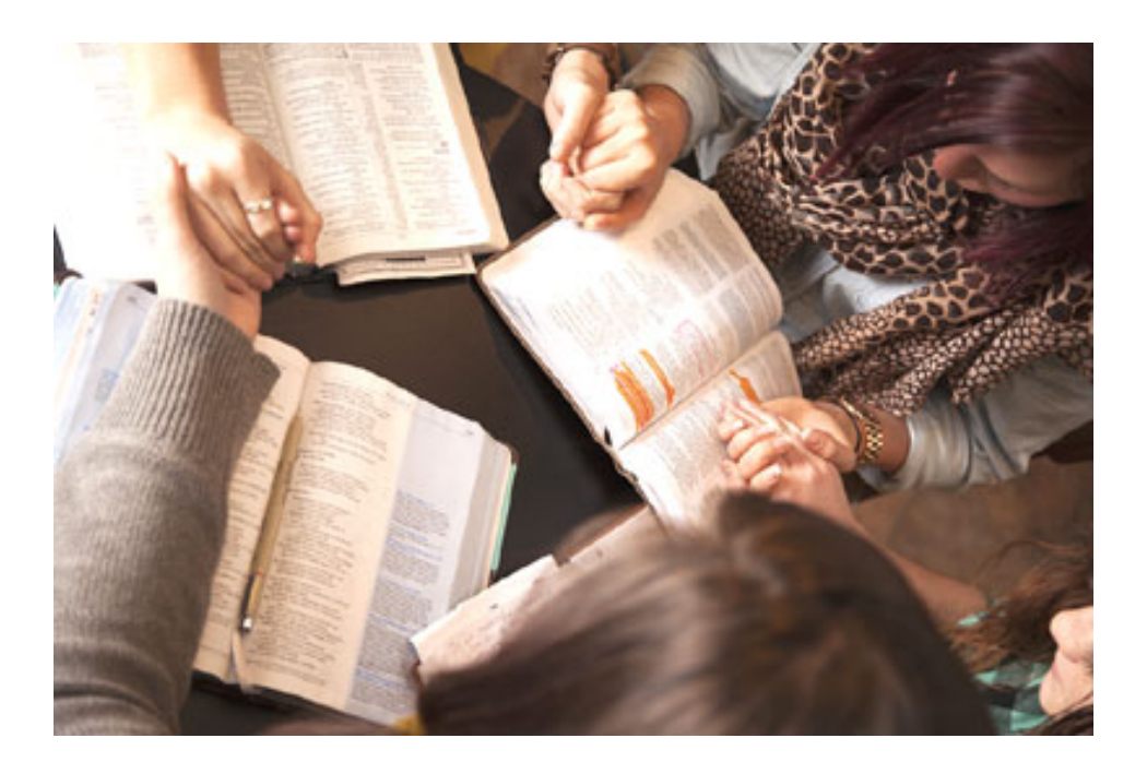
Giving Our All to God