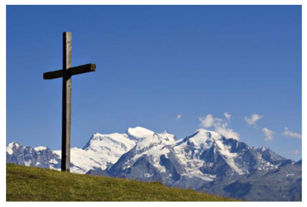
A new dimension of faith as a living encounter with the person of Jesus Christ