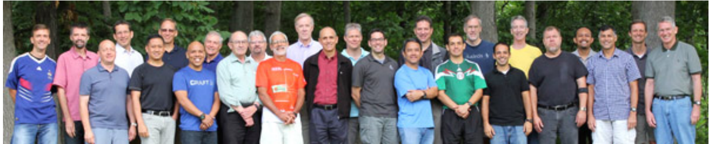
A recent meeting of the International Brotherhood Council - August 2014