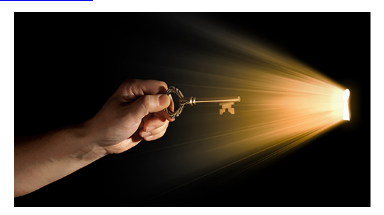
What is Faith?