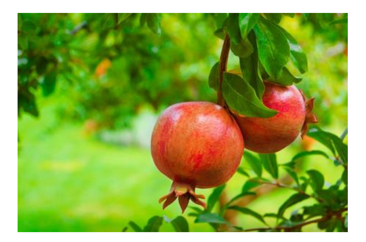
The Fruit of a Faith-filled Life