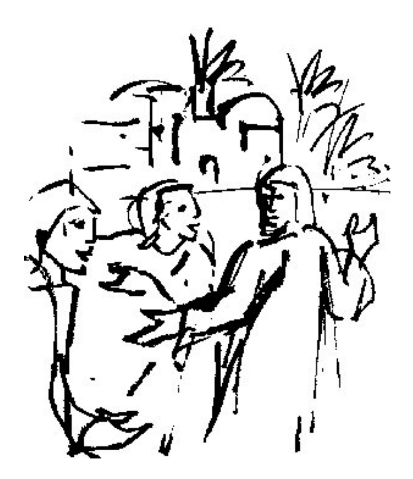
A Scriptural Journey with the Followers of Jesus