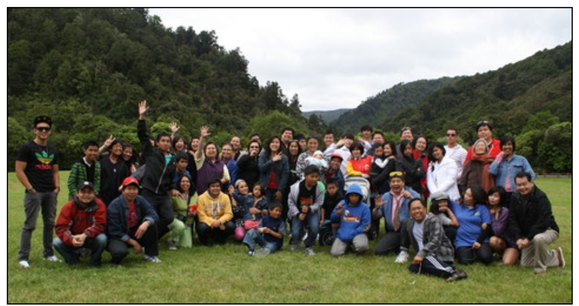
Lamb of God branch in Wellington, New Zealand