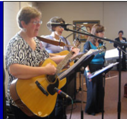
Women from Word of Life Community in Ann Arbor led music for the conference