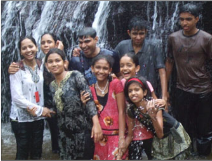
Community youth playing under a waterfall after a long trek