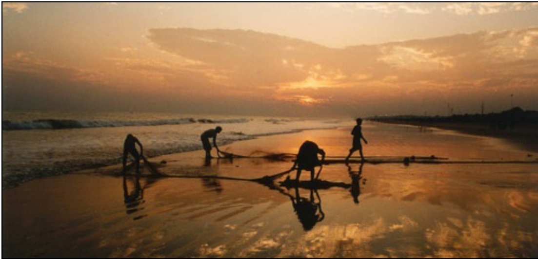
Sunset - Puri, India by Tashimelampo