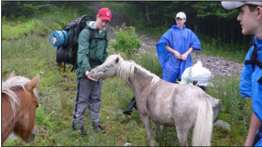
hikers encounter some friendly wild ponies

Despite the challenges to our comfort, backpacking can teach that some of the best things in life are experienced when we seem to have nothing – at least nothing that the world values. The boys found that climbing rocks, playing golf with pebbles and sticks, and merely looking off into the distance at a beautiful vista, can be far more entertaining than anything produced by MTV. They also learned that a person can't appreciate the savory aroma of fried spam until he's been on the trail for three days. In short, backpacking gives these boys an opportunity to find that they can not only live without all the things the world tells them are necessary for survival (i-pods, ESPN, baconators, hamburgers, etc.), they can actually find fulfillment in the absence of these distractions. And in this environment, real spiritual growth can take place.