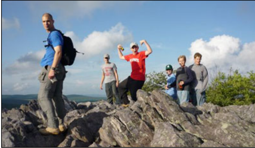
after a day of hiking the young men enjoy an overlook view

Why is it necessary to launch yet another youth program in the SOS-NAR, aimed at middle-schoolers no less? Well, we have strong programs for youth in elementary school, like summer camp and children's gatherings. And at the high school level they can serve on mission trips, and attend the YES retreat. But what do they do for those years when they're too old for camp, but too young for the high school program? There is a need to help our youth in those 'tween years to grow in their charismatic spirituality, to challenge them to live the life of discipleship, and to help them develop cross-community relationships with other people their own age. These experiences, in turn, will help to further their relationship with the Lord, and to gain a broader vision for the work of the Sword of the Spirit. Backpacking is a perfect way to achieve all of this and more.