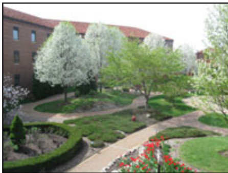
St. John's Retreat Center

More than 115 senior women leaders, pastoral workers, and Kairos mission leaders gathered May 3-7 in Plymouth, Michigan, USA, for the Sword of the Spirit's International Women's Conference. We represented 42 communities and 22 countries. We were graciously hosted in families and households of the Word of Life Community in Ann Arbor, and transported by community members to the lovely St. John's Retreat Center in nearby Plymouth.