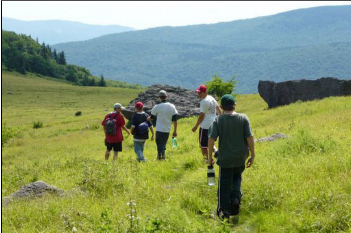
"The Fellowship" scouts out a scenic spot in the Appalachian mountains for lunch