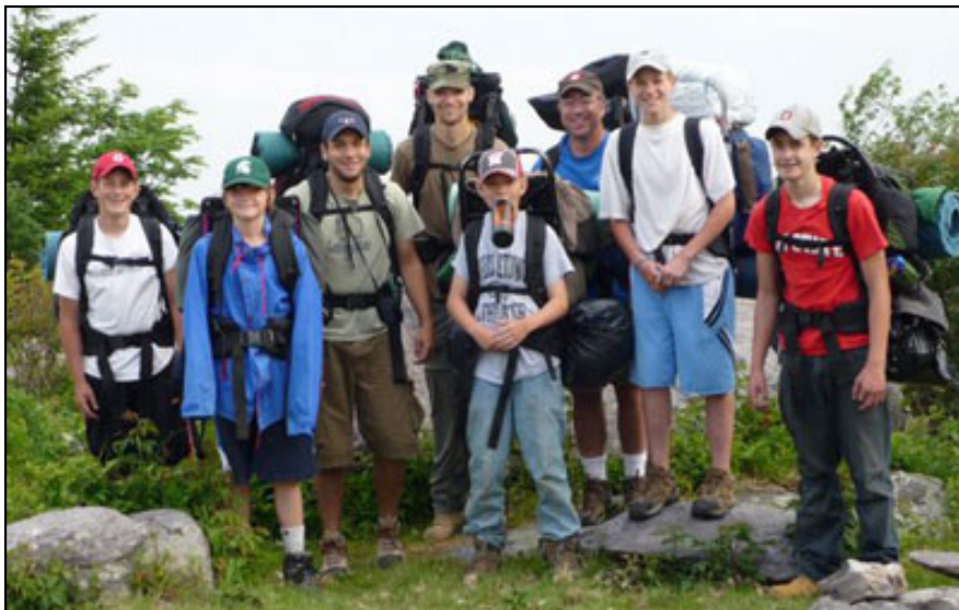
the last day of hiking and final group photo

Despite the challenges to our comfort, backpacking can teach that some of the best things in life are experienced when we seem to have nothing – at least nothing that the world values. The boys found that climbing rocks, playing golf with pebbles and sticks, and merely looking off into the distance at a beautiful vista, can be far more entertaining than anything produced by MTV. They also learned that a person can't appreciate the savory aroma of fried spam until he's been on the trail for three days. In short, backpacking gives these boys an opportunity to find that they can not only live without all the things the world tells them are necessary for survival (i-pods, ESPN, baconators, hamburgers, etc.), they can actually find fulfillment in the absence of these distractions. And in this environment, real spiritual growth can take place.