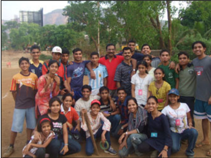
Youth group from Vasai, India