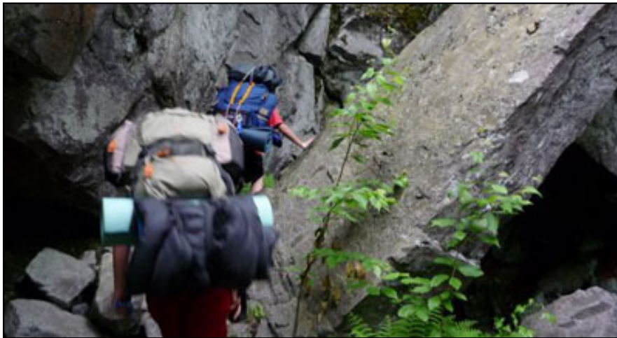
we passed through narrow gaps

Why is it necessary to launch yet another youth program in the SOS-NAR, aimed at middle-schoolers no less? Well, we have strong programs for youth in elementary school, like summer camp and children's gatherings. And at the high school level they can serve on mission trips, and attend the YES retreat. But what do they do for those years when they're too old for camp, but too young for the high school program? There is a need to help our youth in those 'tween years to grow in their charismatic spirituality, to challenge them to live the life of discipleship, and to help them develop cross-community relationships with other people their own age. These experiences, in turn, will help to further their relationship with the Lord, and to gain a broader vision for the work of the Sword of the Spirit. Backpacking is a perfect way to achieve all of this and more.