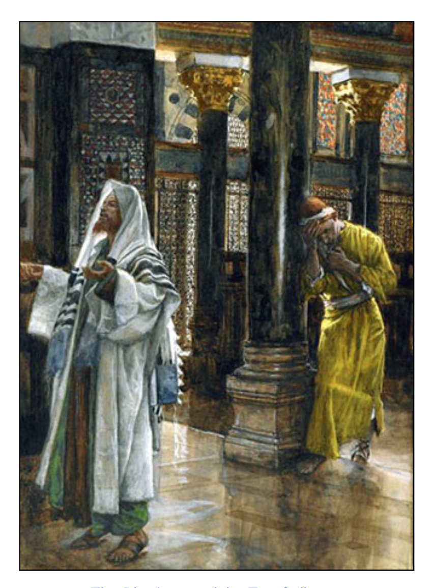
The Pharisee and the Tax Collector