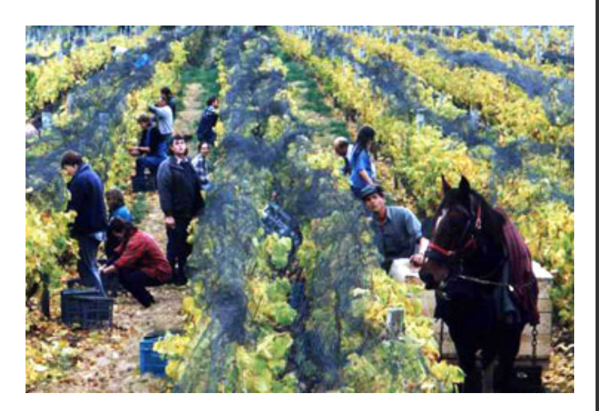
The Outrageous Generosity of God