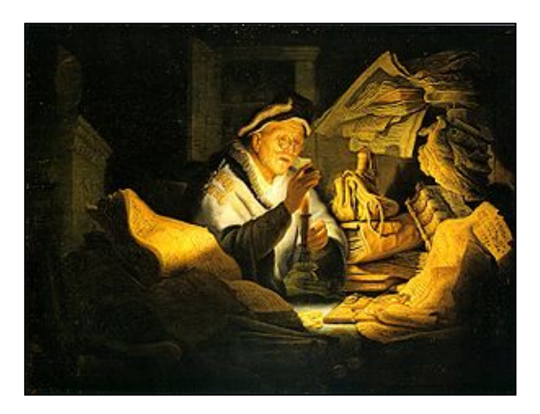
The Rich Fool