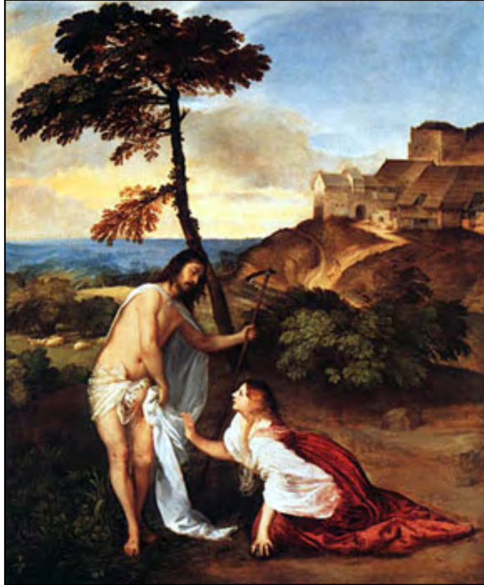
"Noli Me Tangere" ( Do Not Touch Me ) by Titian, 1511-12