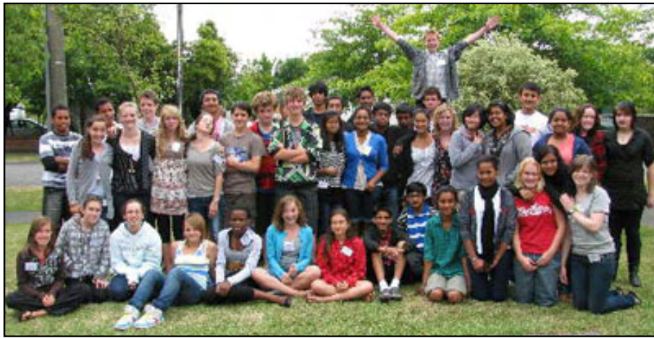
Participants at the Oasis Conference held in Christchurch, NZ

The main Sword of the Spirit presence in New Zealand is the Lamb of God, a national community with seven branches located around the islands. The range of ages, church denominations, locations, cultures, and ethnicities which comprise the Lamb of God brought the words of the gospel writer Luke in Acts to my mind as I met, “devout men from every nation under heaven” (Acts 2) at Oasis and shared life with them during the 10 days of the men’s household which ran in Auckland afterwards.