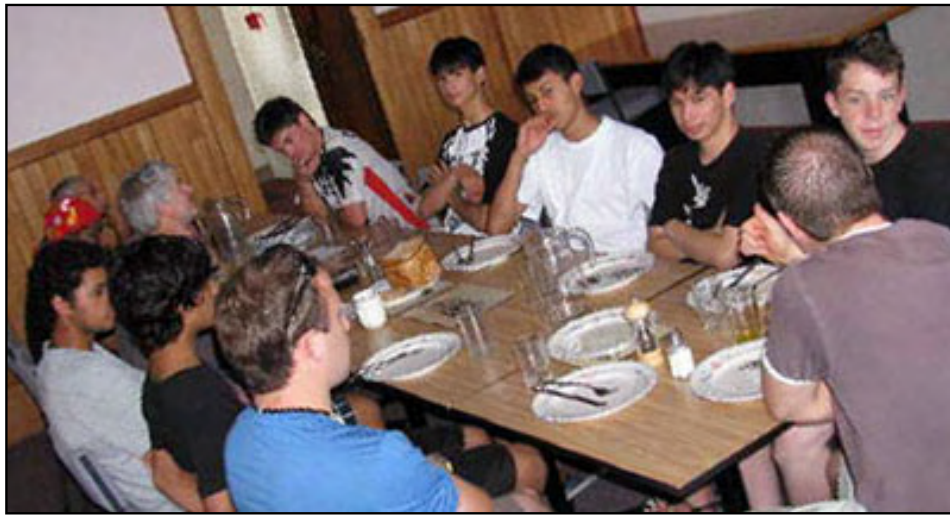
Ten young men, from all over New Zealand, learned how to live in household together

The world is big, God designed it that way, but we are small. Wandering through Hong Kong airport on the return journey, emailing our small mission team back in Belfast about next week's staff meeting while I watched thousands of people whom I will never know flow past me, I could see some of the plan of God in bringing us, a small and insignificant group of people from far flung corners of the world to try, and live together in community. Our divisions, races, classes, and countries are as nothing to him who formed and shaped the earth out of nothing. Through the power of the Holy Spirit we can, and do, live community across, despite, and sometimes through, these barriers. We live it in the power of the same Spirit which breathed on the waters of the Tasman and Irish Seas before they were separated and in whom they will once again be united. The fruit of a life lived in that same spirit is joy, which attended me on the way back across the world from our visit to the Lamb of God.