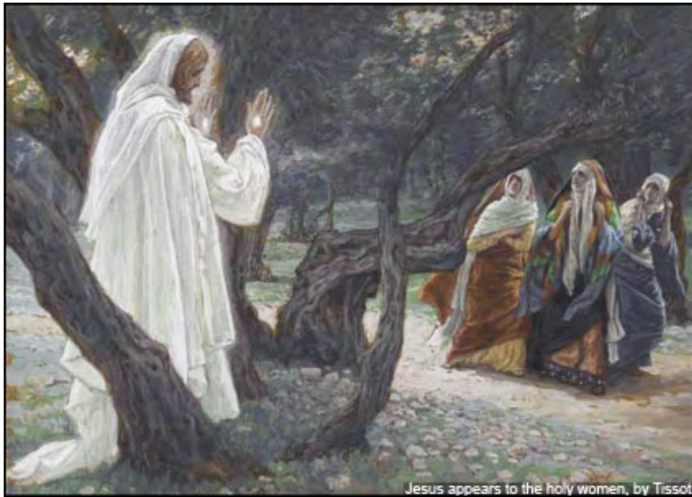
Jesus appears to the holy women, by Tissot